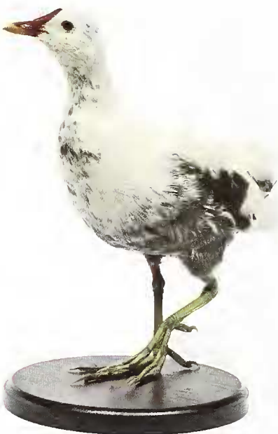
Figure 16. Two specimens of Common Moorhen Gallinula chloropus showing different stages of progressive greying; left: NHMUK 1996.41.2095, right: NHMUK 1996.41.2359